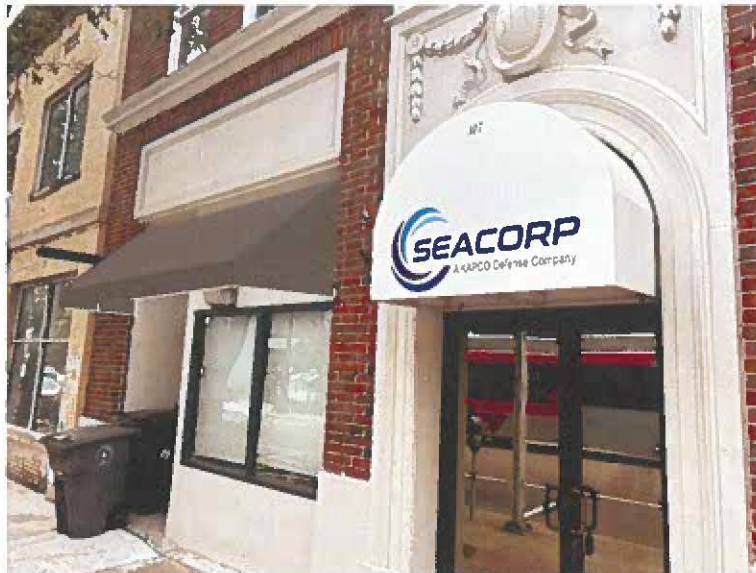
FIGURE 1. FAÇADE RENDERING