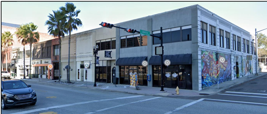
Figure 1. 333 E. Bay Street

There are two additional tenants seeking funding through FAB-REP that will be added to the ground level simultaneously with this DPRP request. Rehabilitation is integral for the property to exceed its current 39.2% occupancy and is expected to increase to 90% + occupancy on an ongoing basis. Development costs and the proposed incentives only contemplate the rehabilitation efforts related to the preservation and rehabilitation of the building. As required by each program, and further communicated with the applicant, no costs may be included for partial reimbursement under more than one DIA program. All costs associated with restoration of the interior shell for concert purposes have been excluded from the construction budget used in underwriting.